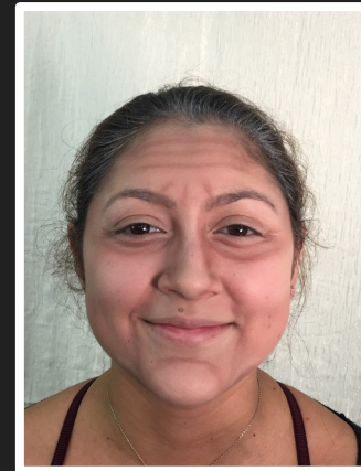
Stage Makeup Class Old Makeup Exercise