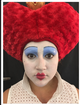
Stage Makeup Class Fantasy Makeup Exercise