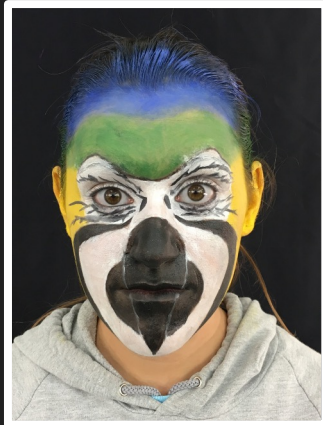
Stage Makeup Class Animal Makeup Exercise