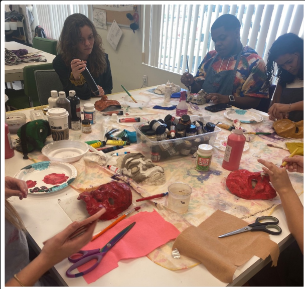
Costume Crafts Class: Mask making